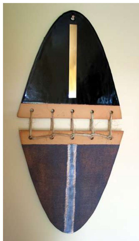
Right: A ceramic sculpture by Mac MacDonald.

workshops, night classes, private lessons in art, design, piano and theory of music