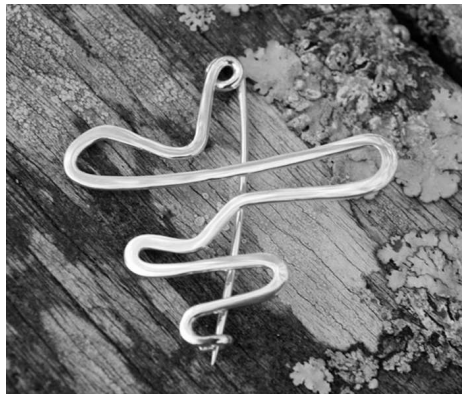
Silver Brooch by Chris Donegan

Chris enjoys texturing work, including using a rolling mill which can produce different surface effects depending on the material she includes in the milling, and reticulating. Reticulating involves melting the surface of the metal to a liquid which can be worked and produces unexpected effects. She also enjoys the alchemy of putting hot metal into liquid or acid and its results.